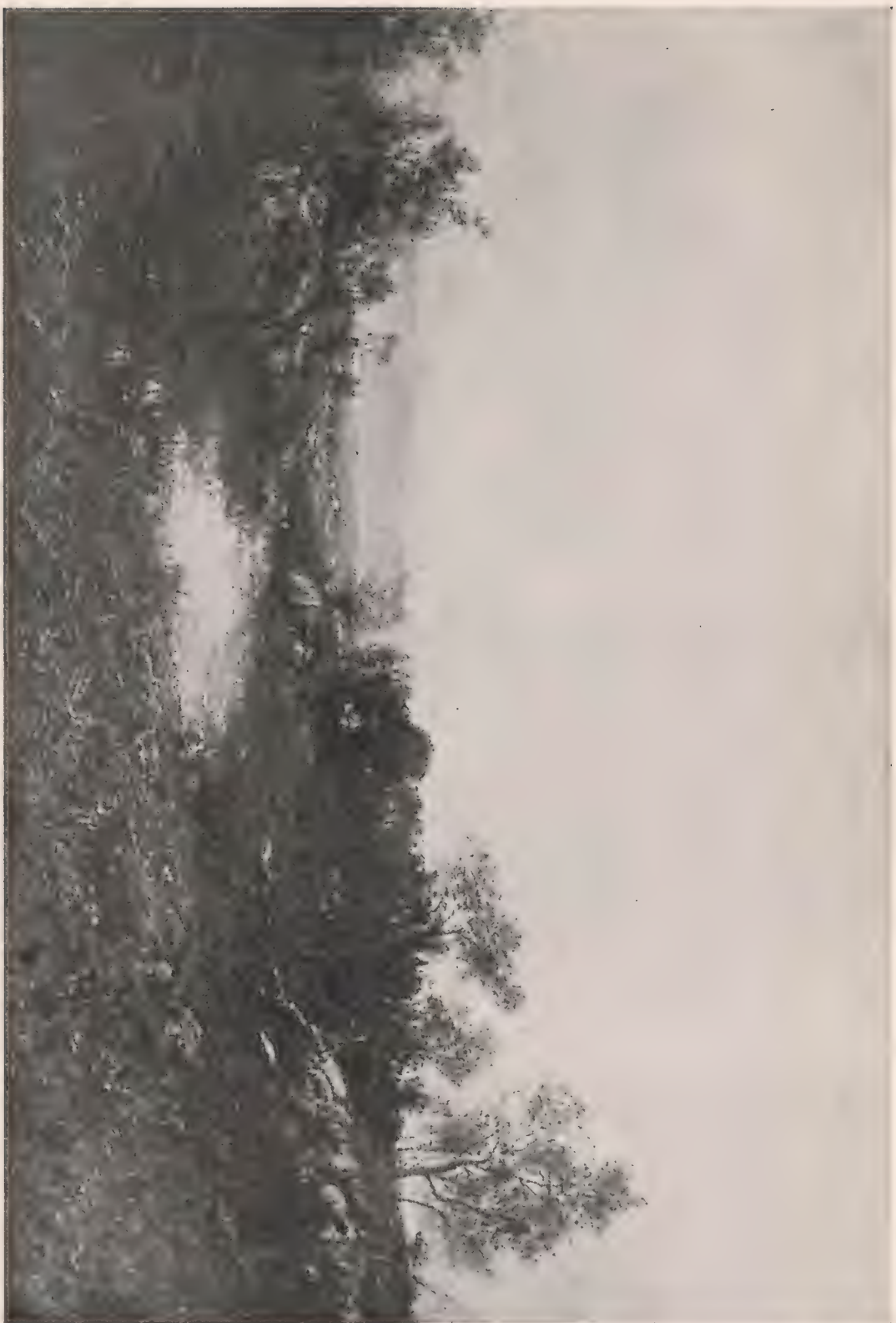
A Wayside Pool